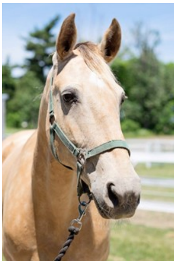
Dickens (above) and Anea (right) were proudly retired in the summer.